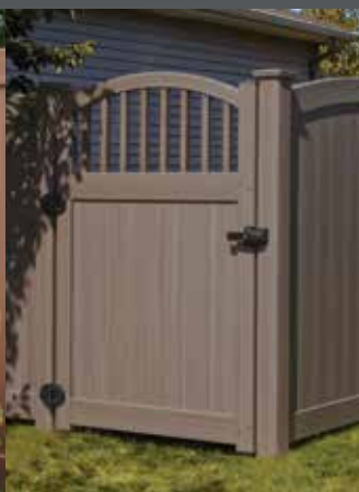
Chesterfield CertaGrain Texture Convex Gate with Victorian Accent in Weathered Blend