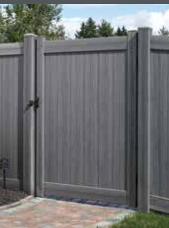
Chesterfield CertaGrain Texture in Arctic Blend

GATES Built to last - Gates for every style