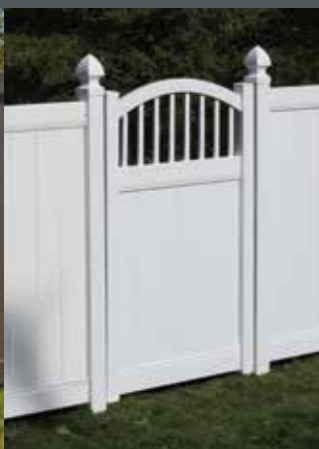
Chesterfield Smooth Finish Convex Gate with Victorian Accent in White