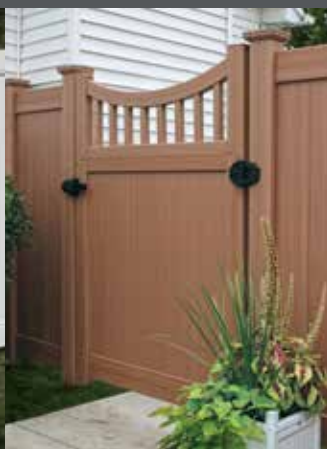
Chesterfield CertaGrain Texture Concave Gate with Victorian Accent in Sierra Blend