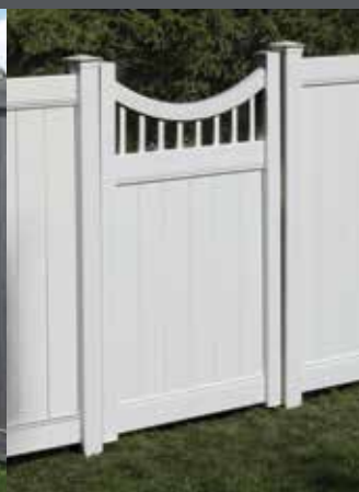
Chesterfield Smooth Finish Concave Gate with Victorian Accent in White