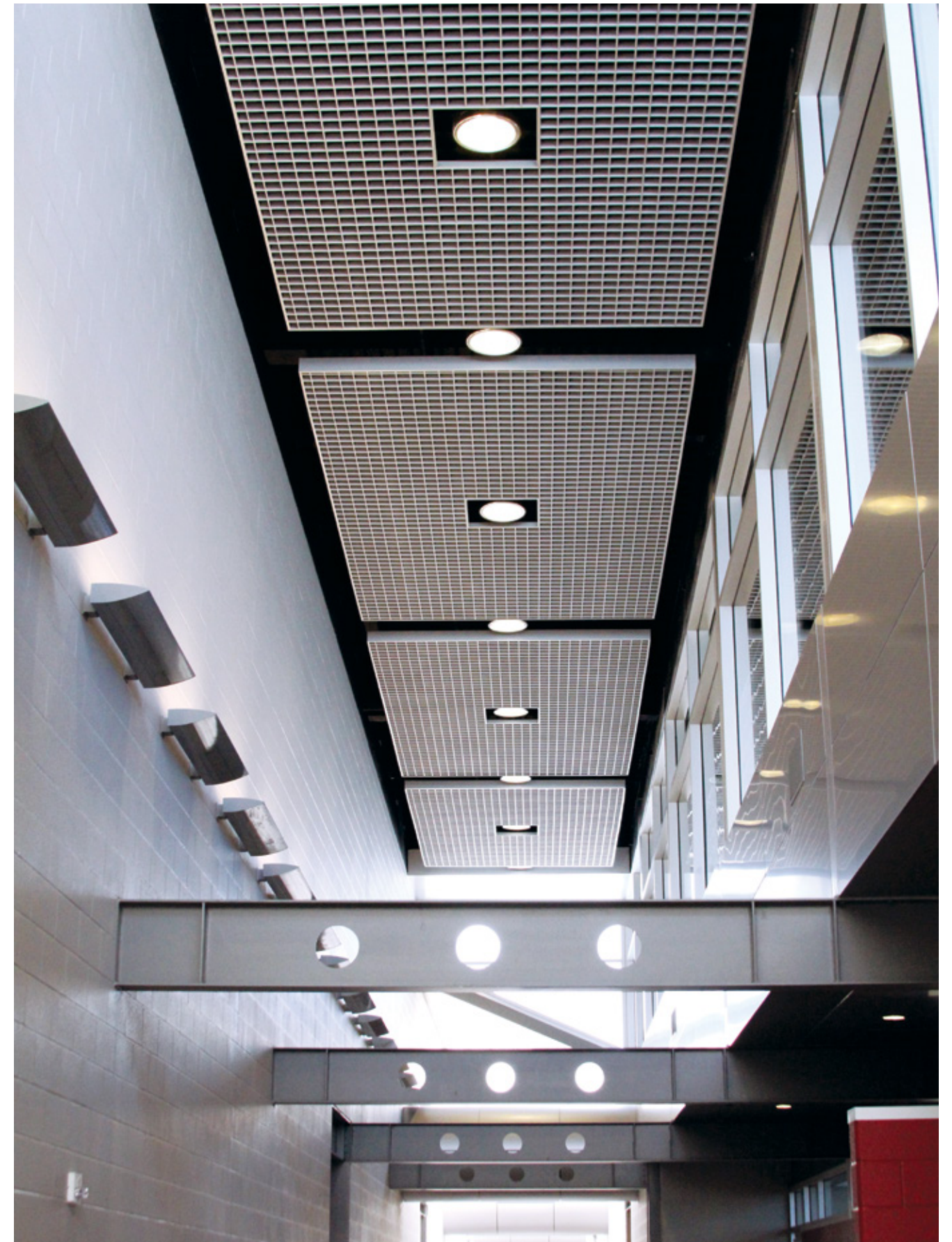
Project: National Center for Aviation Training (NCAT), Wichita, KS; Open Cell