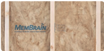
Air and Moisture Management