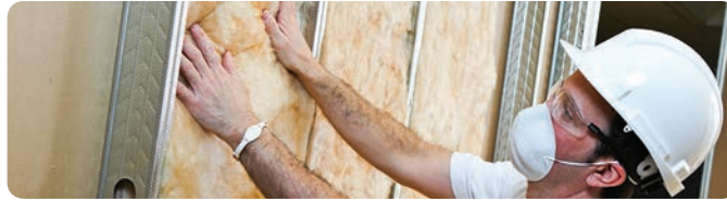
CertaPro® Commercial Insulation