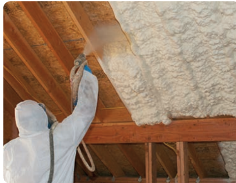
Spray Foam Insulation