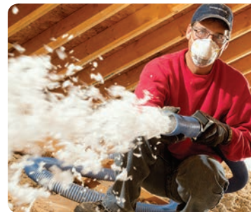
Premium Blow-in Insulation