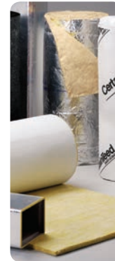
HVAC / Mechanical