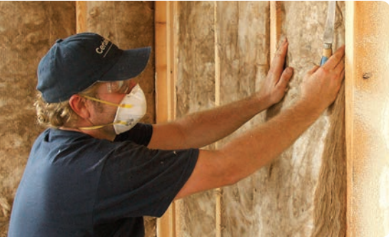
Residential Sustainable Insulation®

For every insulation challenge, there's a CertainTeed solution.